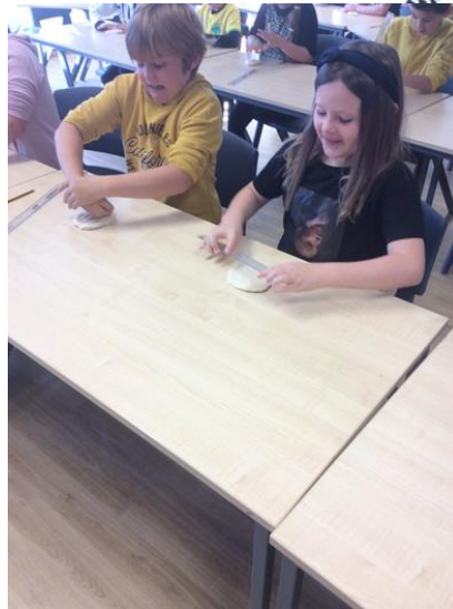
Making pizza instructions in Y2: